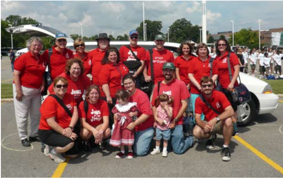
Left: some of the outreach participants and our friends at Jews For Jesus in preparation for the 4th of July parade in Skokie.